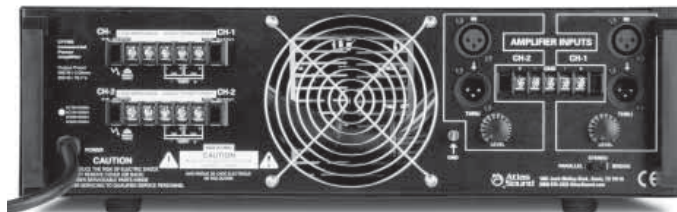
CP700 (Rear View)