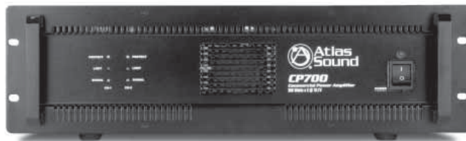
CP700 (Front View)